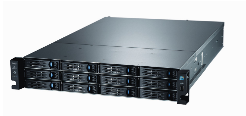
Figure 1 Iomega StorCenter ix12-300r Network Storage Array

Figure 1 illustrates an Iomega StorCenter ix12-300r Network Storage Array.